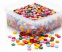
1.2 kg tub