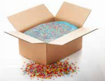
10-15 kg carton