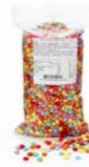
1 kg bag

The chocolate lentils come in different packages and volumes from bags, boxes/tubs, cartons to Big Bags of 600 kg.