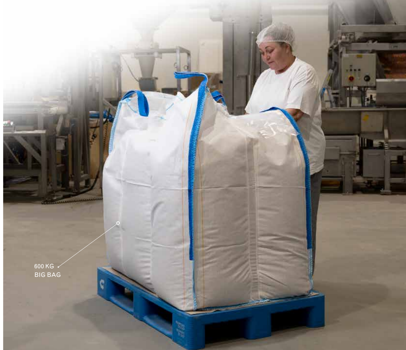
600 KG BIG BAG