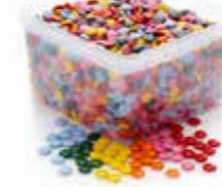
2.5 kg tub