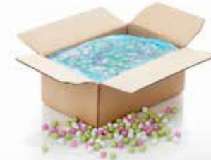
5 kg carton