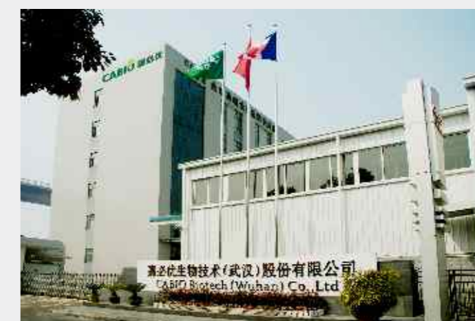
嘉必优江夏工厂 | CABIO's Jiangxia Factory