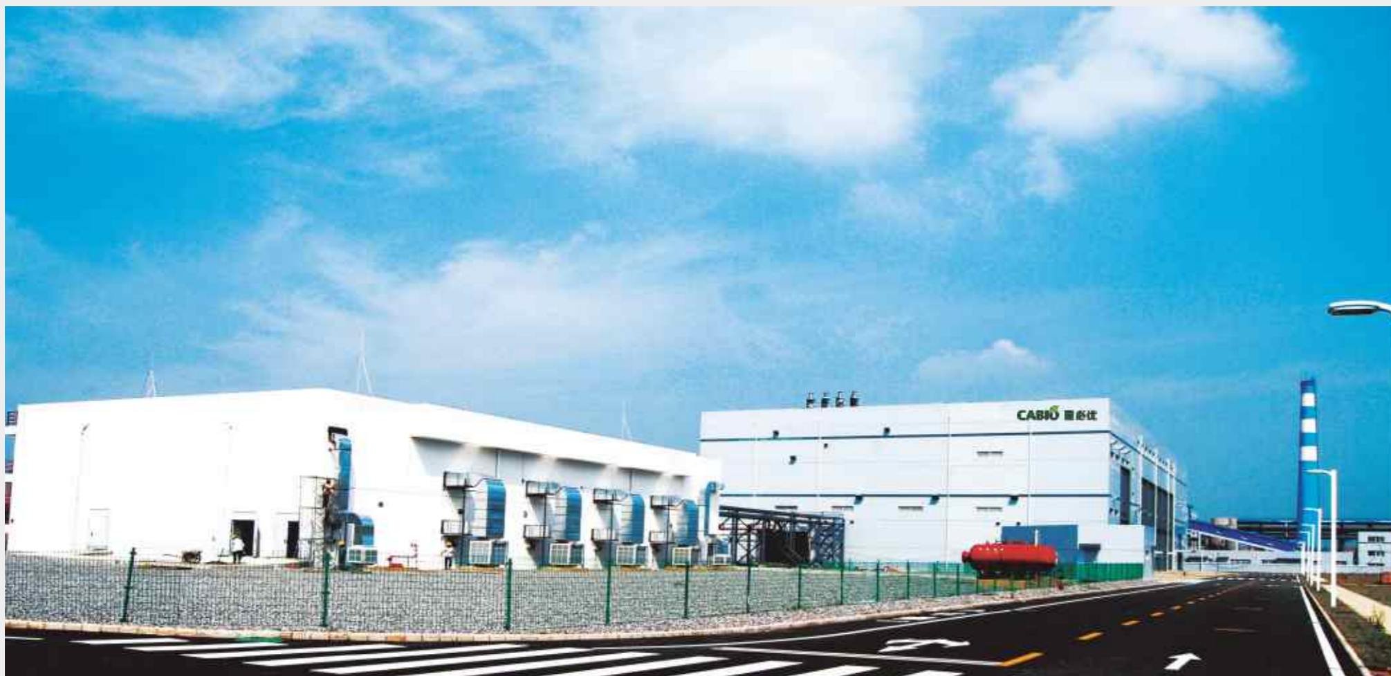
嘉必优葛店工厂 | CABIO's Gedian Factory